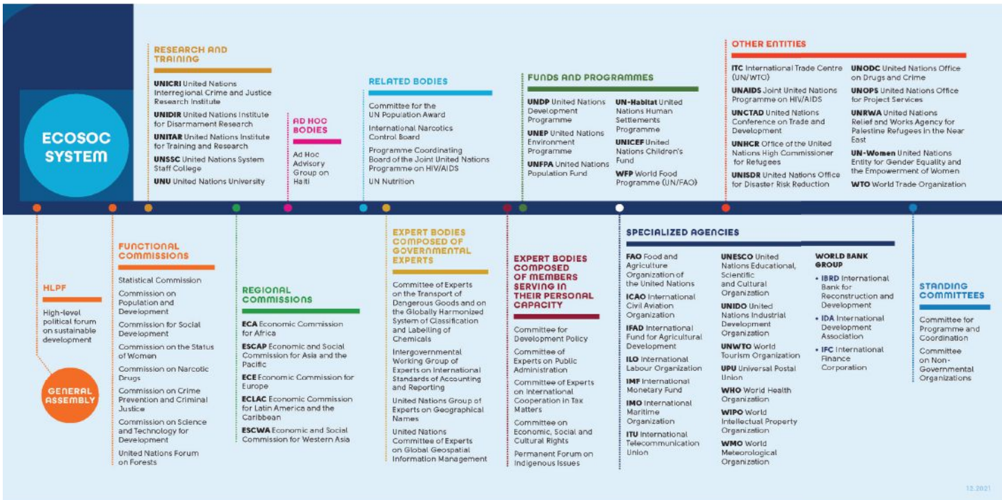
Figure 1 The U.N. Economic and Social Council (ECOSOC) detailed.

The Foundation's seat at the U.N. table through ECOSOC allows for limitless possibilities to advance the FM profession. The Foundation's work is centered around improving social equity by making more FM education programs accessible to women, minority communities, the underserved, the unemployed and the underemployed to fill the much-needed talent gap in the profession. ECOSOC also is particularly interested in strengthening the position of the Global South, the mutual