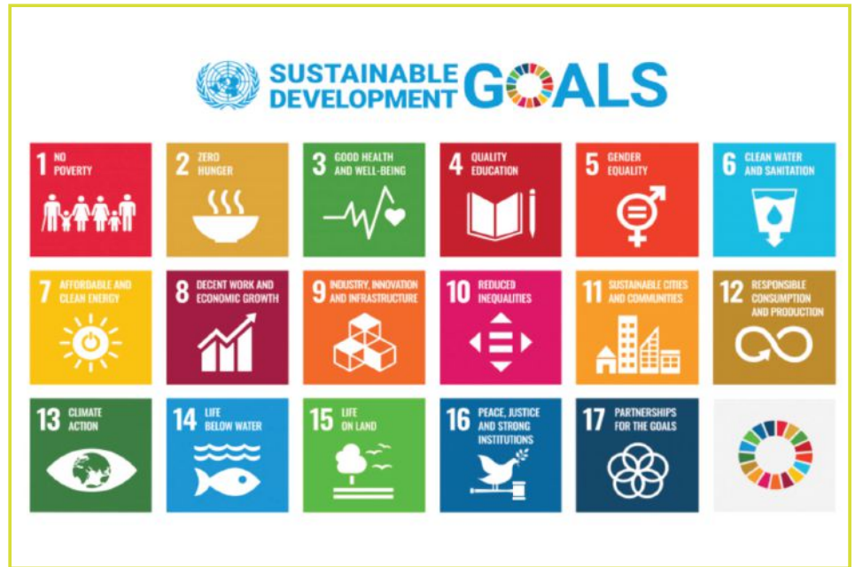
Figure 2 The 17 U.N. Sustainable Development Goals (SDGs).

In a wider context, as an U.N. NGO, the IFMA Foundation’s objective is also to contribute to ECOSOC through awareness raising, development of educational programs, policy advocacy, joint operational projects, participation in intergovernmental